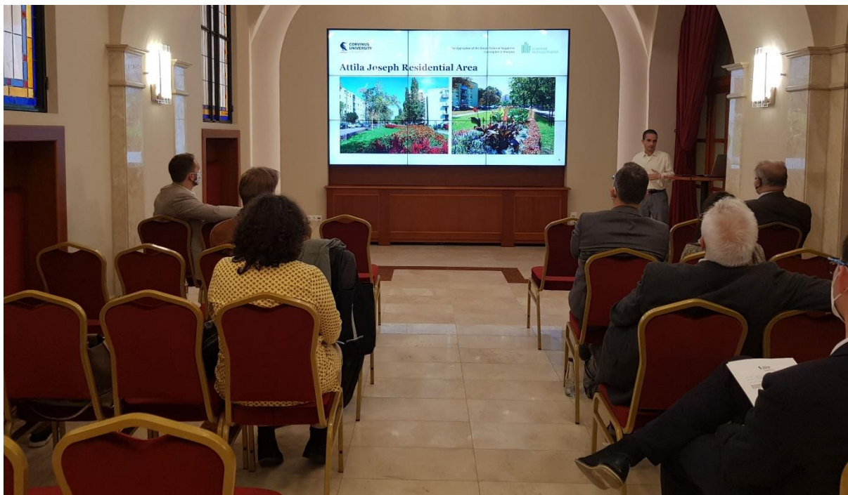
Picture 3. From happiness ... results of a qualitative explorative investigation by the Economy & Religion program